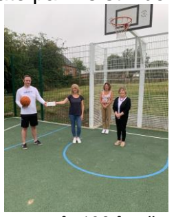
Opening of MUGA and handing over of s106 funding